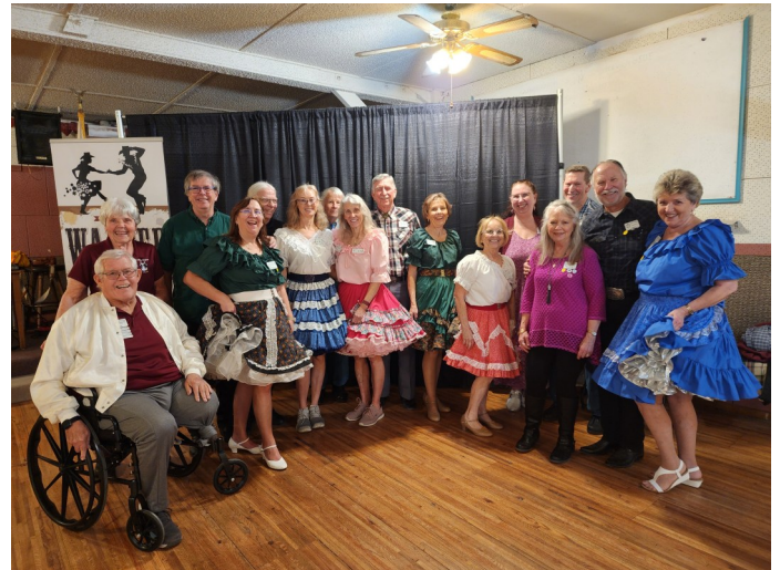
Cowtown Singles at January's 4th Sunday Class