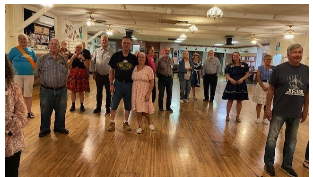
2023 Class Angels