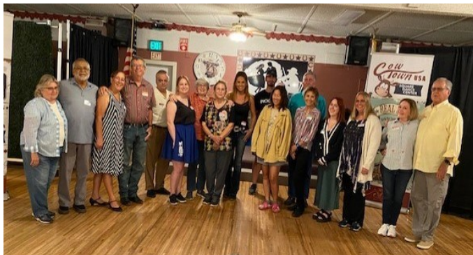
2023 1st Night Students