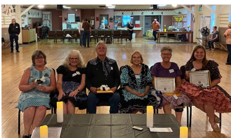
Class of 2023