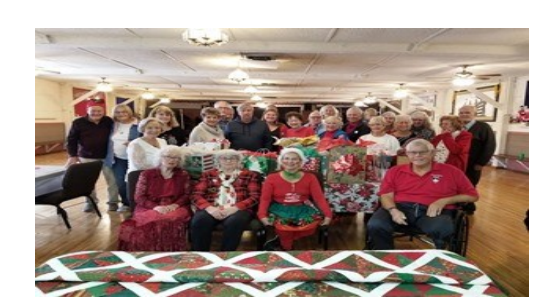
Cowtown Singles Christmas Party 2022