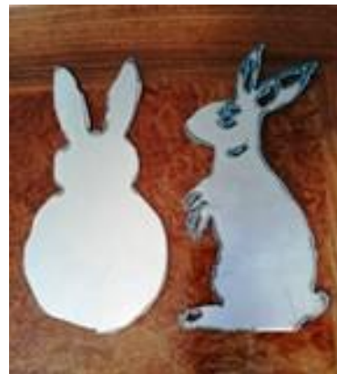
Teryl's making next year's Easter's bunnies out of sheet metal on a plasma cutter.

Rounds Rick Gittelman 7:30-10:30 Squares 8-10:30