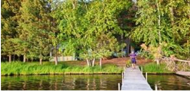
Gene's North Woods Adventure