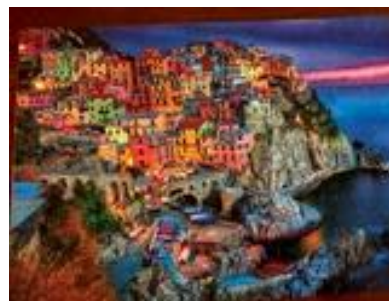
Dan and Betty's Challenge puzzle WOW!

Teryl's Welding Garden is coming together..No Water needed!!