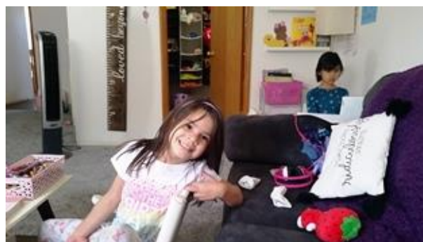
First in-person visit person with grand daughters in a year in their new home.