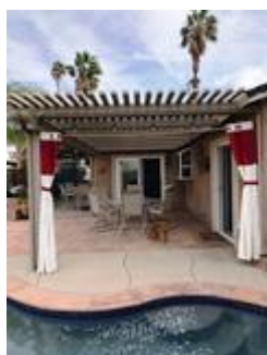
Shawn's Cozy Backyard Get Away