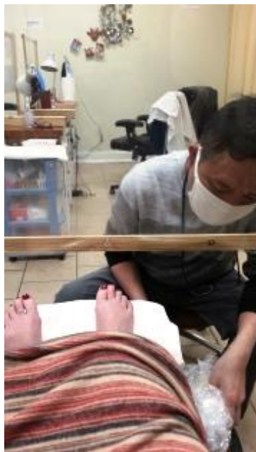
First pandemic pedicure. Gues who's toes aren't shredding sheets