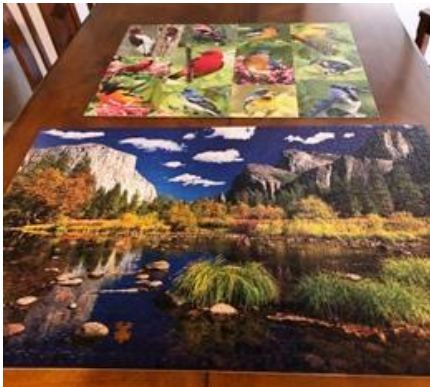
Birds and a Yosemite Puzzles

A late night swim and S'mores at the firepit is a great end of the day activity!