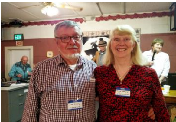
Ottawa Canada visits our 4th Sunday Dance