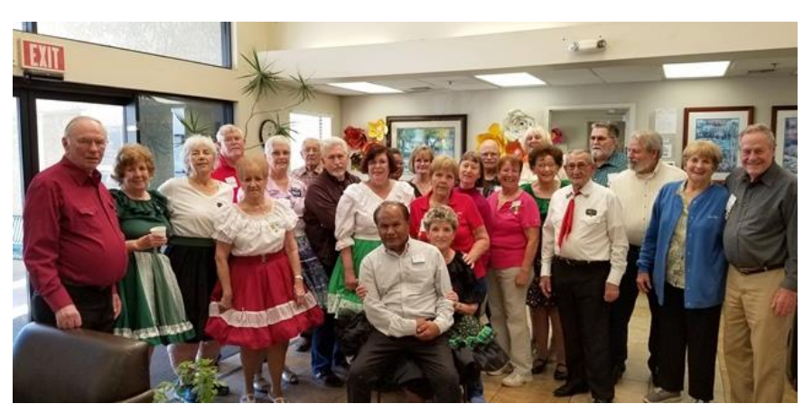
Cowtown Singles Class and Club at Twirlers 44th Anniversary