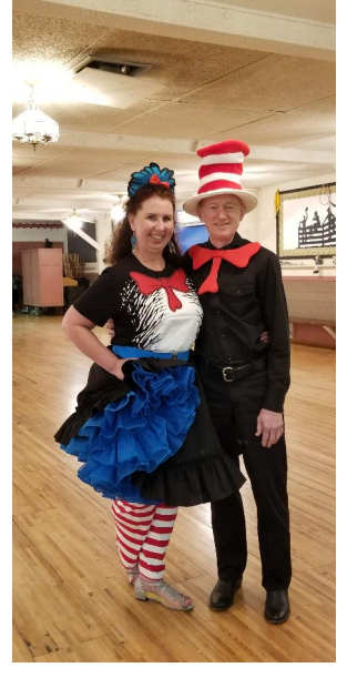
Cat in the Hat Dance